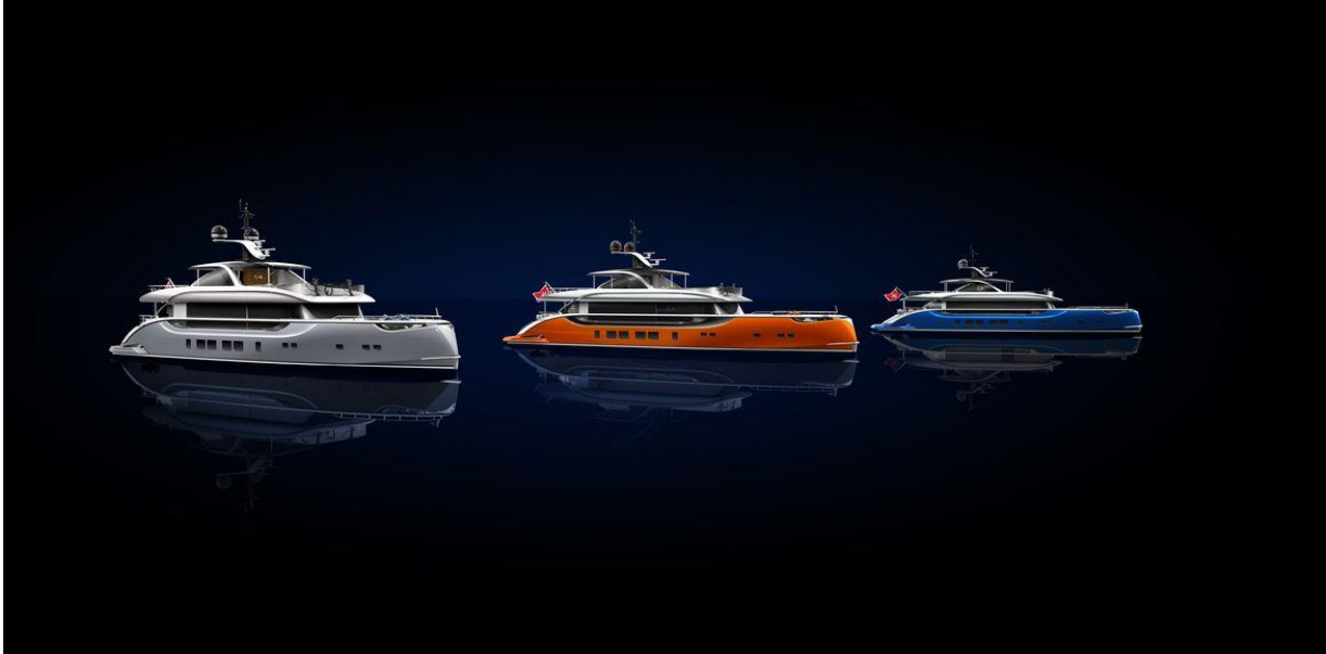
The Range: D4 L, S4 and D4