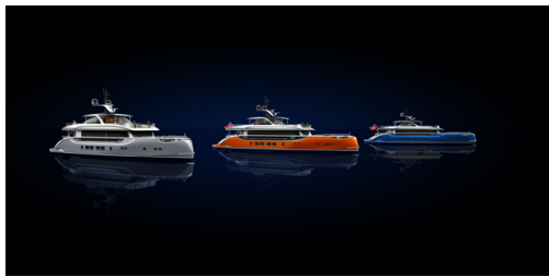
The Dynamiq range

The first D4 is currently in build at the Nuovi Cantieri Apuania facility (now owned by the Italian Sea Group) in Carrara, Italy. The yacht is scheduled to be launched next summer and will be on display at the 2016 Monaco Yacht Show.