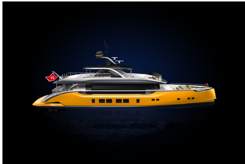
The S4 GTS

What makes the Dynamiq business model excitingly different is the price range and how the yachts are marketed. In his own words, Dobroserdov has "specifically worked to achieve a very competitive price." The D4, for example, is available at a base price of €13,900,000, while the D4 L will start from €14,750,000 and D4 S sport version at €15,500,000.